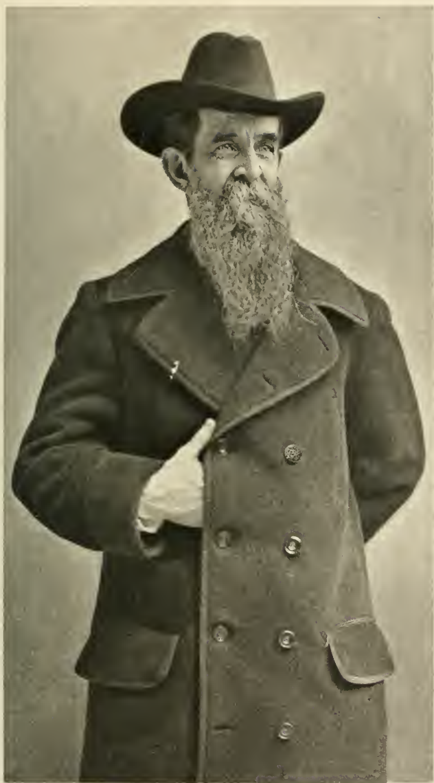
At the age of 58